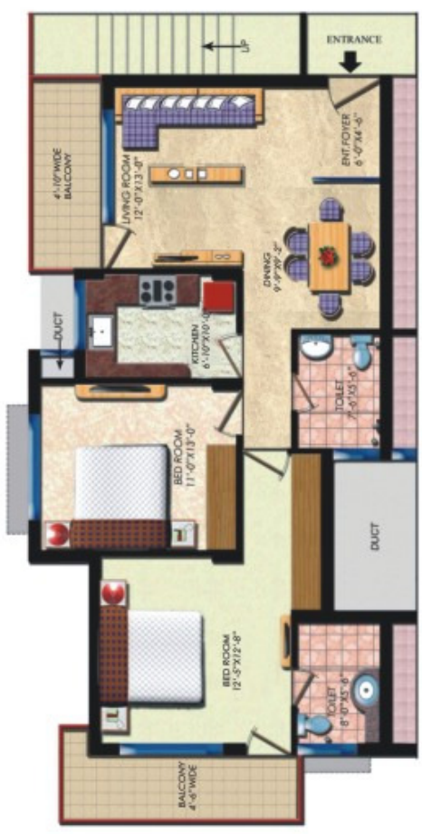
2 BHK Apartment Super Area : 1186 sq.ft. (110.18 sq.mtrs.)